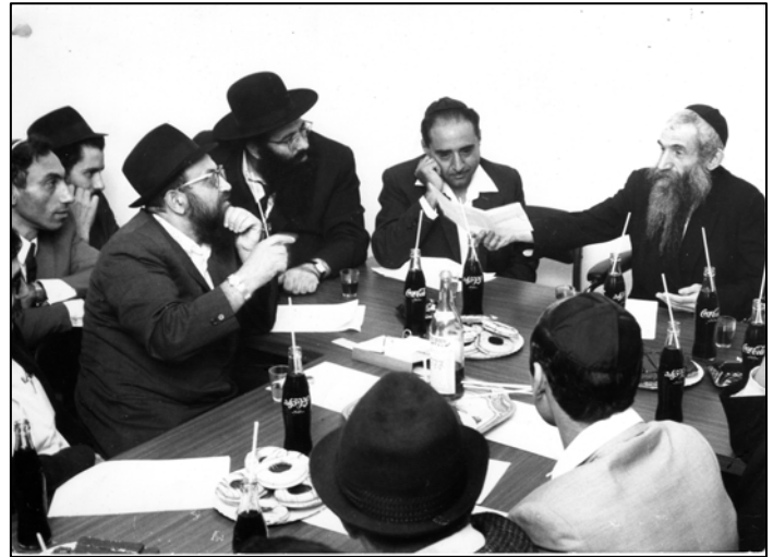
At a meeting with the members of the city council of Kiryat Malachi, with some Chabad Chassidim.